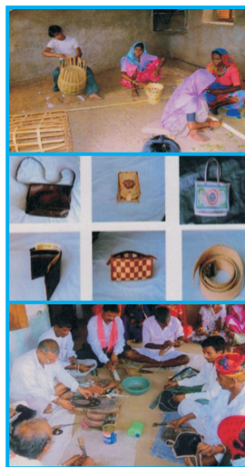
Trainees at the bamboo decorative items and leather crafts training programme

4. Gramin Vikas Trust (GVT): Gramin Vikas Trust conducted a total of three skill development programmes (i) A 21 day programme on Bamboo Decorative Items at village Chotti Sarva, Banswara district from 09.05.2012 to 29.05.2012 with 20 participants. (ii) A 21 day programme on Leather Craft items at village Baroda, Banswara district from 13.05.2012 to 02.06.2012 with 20 participants. (iii) A 21 day programme on Spices Processing and Packaging at village Rani Barod, Baran district from 18.04.2012 to 10.05.2012 with 20 participants.