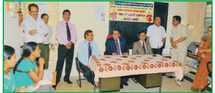
Shri M V Tanksale, CMD, CBI (centre) interacting with the trainees

The Central Bank of India, RSETI, Ahmednagar conducted a training programme on setting up and maintaining beauty parlour from 16 th to 28 th July 2012 for 30 BPL women from 29 different villages. Shri M V Tanksale, Chairman and Managing Director, Central Bank of India visited the RSETI on 21.07.2012. He interacted with the trainees. The CMD was informed by the participants that because of the training they are now confident to start their own units. The CMD opined that after completion of the training, the trainees would get wage employment or will start their own unit with credit linkage from the Bank.