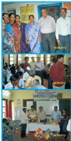
Certificate and tool kits distribution function for trainees of tractor repairing/servicing and motor rewinding training programmes.

1. MYRADA, Gulbarga : MYRADA, CIDOR, Gulbarga centre organized two skill development programmes for rural youth to prepare & motivate them to go for micro enterprise under the Project Enterprise initiative of NIRD. One for Tractor servicing and maintenance and other for Rewinding of motors and maintenance of pump sets. In each programme there were thirty participants. The closing ceremony and certificate distribution function was held on 18 th August 2012 at their Kamlapur centre. Shri O N Bansal, PD RSETI, NIRD graced the occasion and distributed the Certificates and Toolkits to the participants. He also had interaction with the participants as well as with the trainers. All the trainees were from rural areas and from poor families and in the age group of 18 to 25 years. Majority of them were college dropouts after PUC. These trainees were identified and sponsored by CRPs working for Myrada. During the course of interaction it was learnt that some of the youth had started the activities and some were working with other service providers on wage basis to gain more hands on experience before they start their own activities. Myrada officials were advised to be in touch and follow up all the trainees and provide all possible support till they are in a position to establish their own enterprises to earn livelihood.