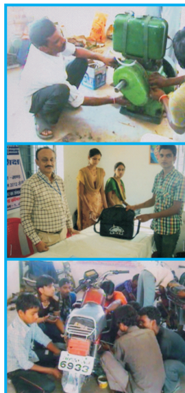
Trainees of repair of diesel pumps and two wheelers programme and certificate and tool kit distribution to trainees

3. Natural Resource Management and Common Wealth, Bhopal : NRMCW, Bhopal organized a skill development training programme on Repair and Maintenance of Diesel and Electric Pump sets of 30 days duration with 30 participants. NRMCW also organized another skill development programme on repair and maintenance of two wheelers from 24.04.2012 to 13.06.2012 for 30 participants at village Bijadandi of Mandla district which is one of the LWE districts. The response reported was quite tremendous. The participants took keen interest in learning. In these programmes more emphasis was given on practical orientation hands on practice for repair of diesel pump sets and two wheelers. On the concluding day the participants were given certificates and tool kits so that soon after they go to their village they can engage themselves in repairing of pump sets or two wheelers as the case may be. The NRMCW also involved some bank officials and the CEO, DRDA in the programme.